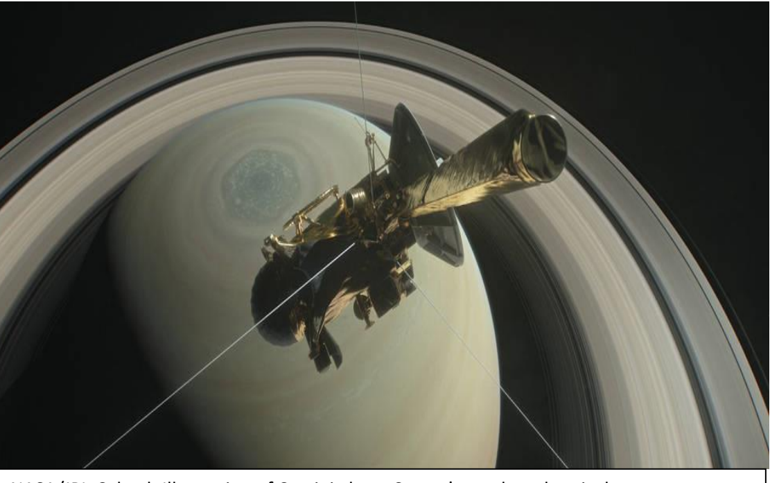
Illustration of Cassini above Saturn's northern hemisphere

Huygens has helped us do precisely that. Its landing on Titan revealed Titan's atmosphere to be composed of methane and carbon compounds, and revealed its surface to be rocky and eroded similar to Earth's. Although Huygens was not equipped to detect complex organic compounds, scientists believe that Titan's atmosphere resembles that of early Earth's, and some even say that Titan could harbor life under these conditions.